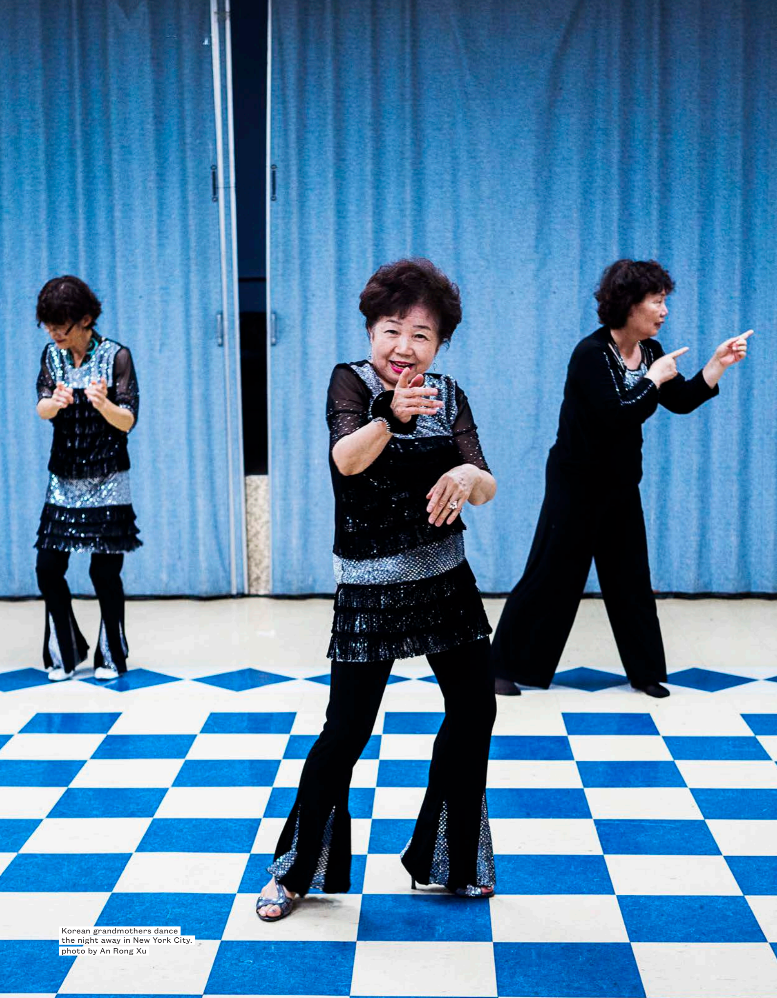
Korean grandmothers dance the night away in New York City.