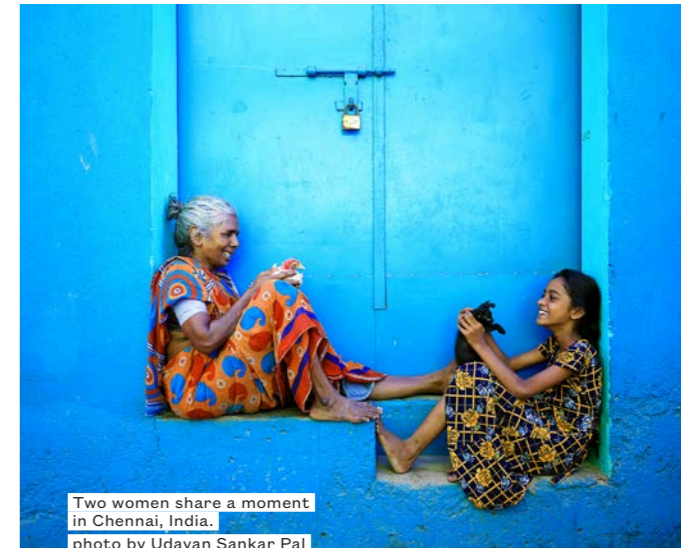
Two women share a moment in Chennai, India.