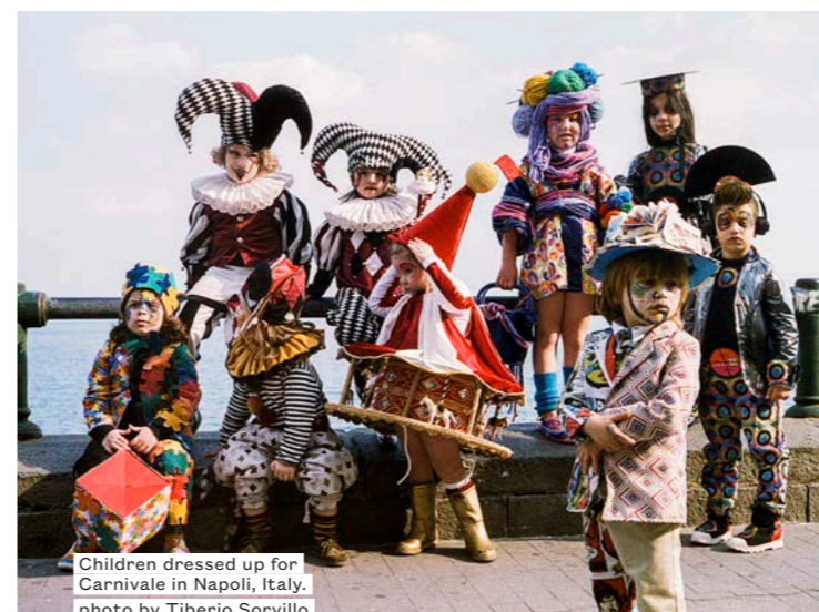
Children dressed up for Carnivale in Napoli, Italy.